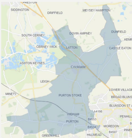
Cricklade & Purton