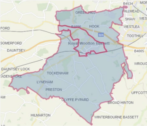
Royal Wootton Bassett